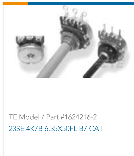
TE Model / Part #1624216-2 23SE 4K7B 6.35X50FL B7 CAT