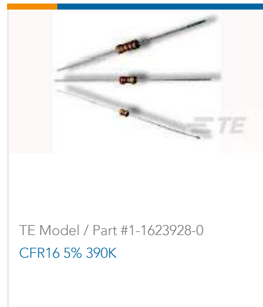
TE Model / Part #1-1623928-0 CFR16 5% 390K