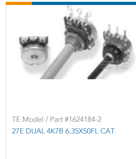
TE Model / Part #1624184-2 27E DUAL 4K7B 6.35X50FL CAT