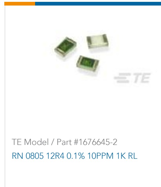
TE Model / Part #1676645-2 RN 0805 12R4 0.1% 10PPM 1K RL