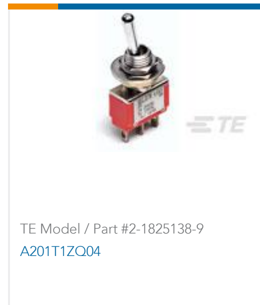
TE Model / Part #2-1825138-9 A201T1ZQ04